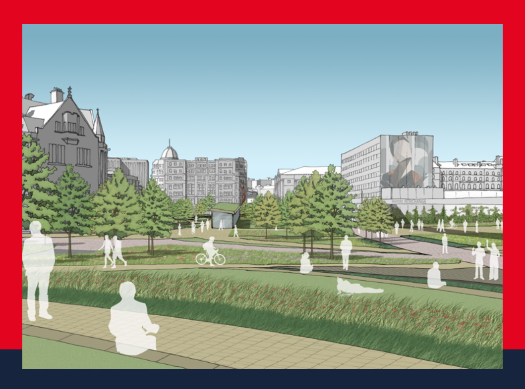
Artist Impression - Hall Ings Terraces

For a timetable in an alternative language, large print, Braille, audio CD or tape, please contact MetroLine on 0113 245 7676 .